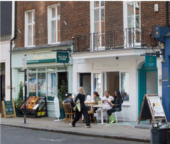
→ ECCLESTON STREET