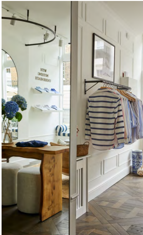
→ WNU 47 ELIZABETH STREET