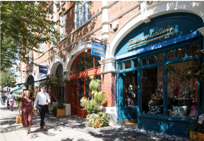
→ ECCLESTON STREET

Eccleston Street is Belgravia village’s high street, which serves as an amenity destination for the local office contingent and loyal residential community.