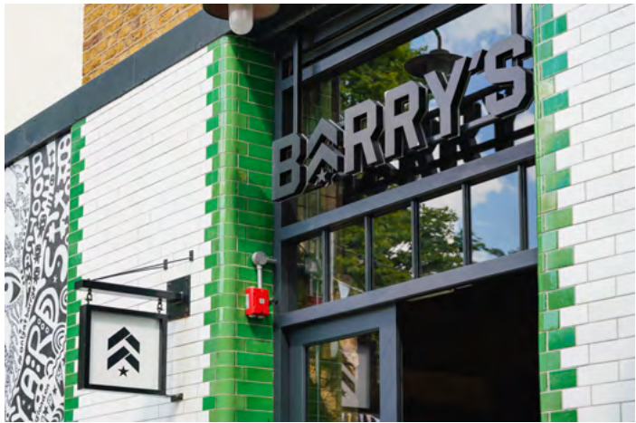
→ BARRY’S ECCLESTON YARDS

Eccleston Yards brings together the best of the neighbourhood, with an edge. Contemporary dining, cult wellness, creativity and a renowned wine studio surround a buzzing courtyard which changes throughout the year.