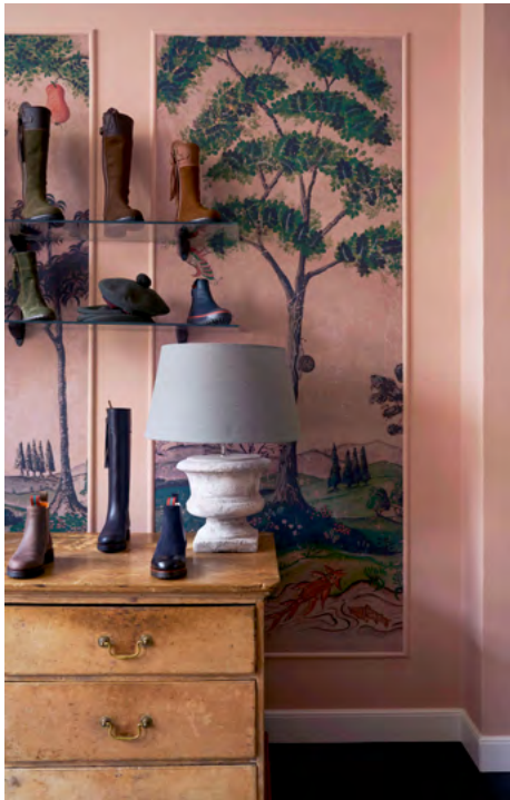
→ PENELOPE CHILVERS 75 ELIZABETH STREET