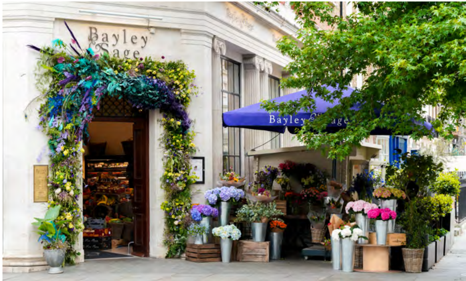
→ BAYLEY & SAGE 141 EBURY STREET