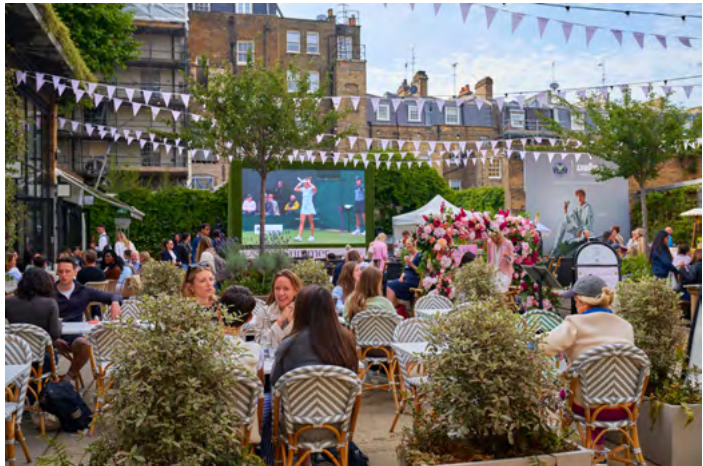
→ ECCLESTON YARDS