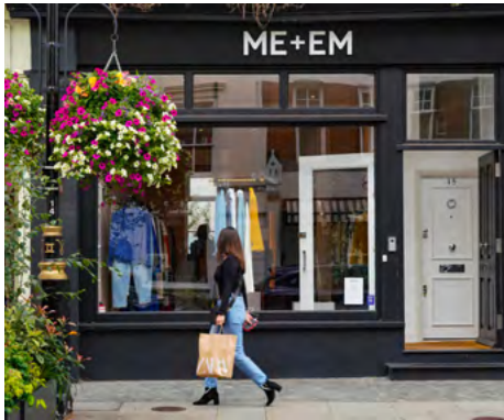
→ ME+EM 45 ELIZABETH STREET

→ “We are loving our new home in Eccleston Street – it has a village feel with a vibrant food offering.”