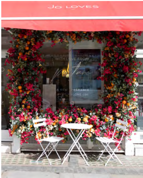
→ JO LOVES 42 ELIZABETH STREET