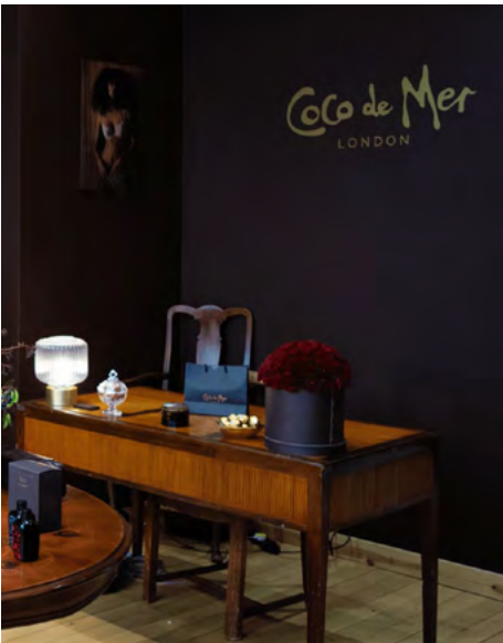
→ COCO DE MER 24A MOTCOMB STREET

→ “We love the intimate feel of the street with its wonderful mix of residents, small business owners and visitors. A charming hidden gem, away from the bustle of the tourist sites close by, the pedestrianised street allows for outdoor eating and drinking as well as an eclectic mix of retail – it is truly an icon of a street”