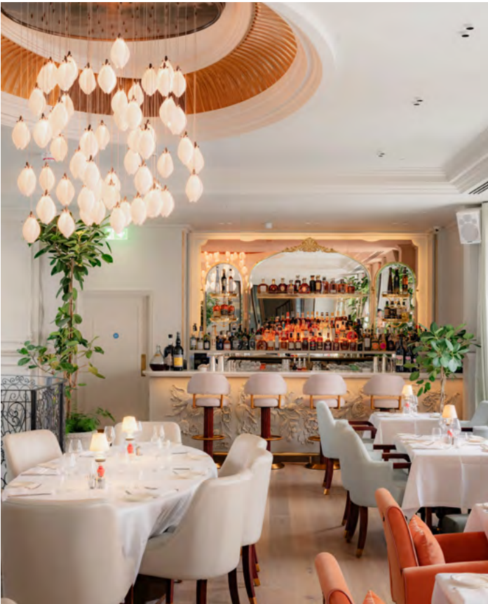
→ AMÉLIE 19 MOTCOMB STREET

Motcomb Steet is an elegant retail oasis only minutes from Harrods, Harvey Nichols. A cluster of 4* and 5* hotels, including the Berkeley, the Jumeirah Lowndes, and The Peninsula ensure the street’s exposure to a consistent flow of international customers. Despite incredible proximity to the bustle of Knightsbridge, the street is a haven of calm renowned for its luxury fashion, fine dining, and upscale beauty offerings.