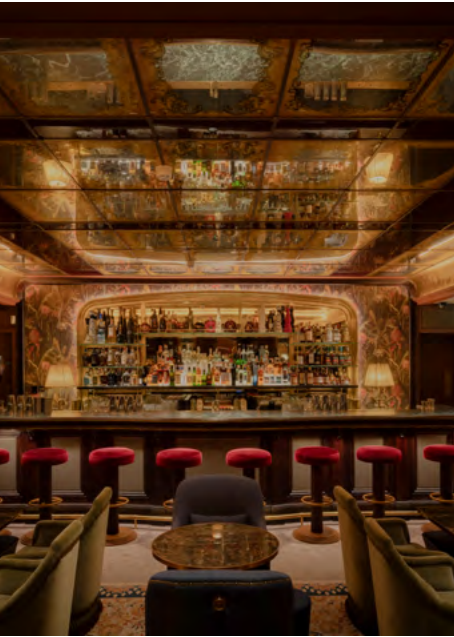
→ LUUM 19 MOTCOMB STREET

→ “We love the intimate feel of the street with its wonderful mix of residents, small business owners and visitors. A charming hidden gem, away from the bustle of the tourist sites close by, the pedestrianised street allows for outdoor eating and drinking as well as an eclectic mix of retail – it is truly an icon of a street”