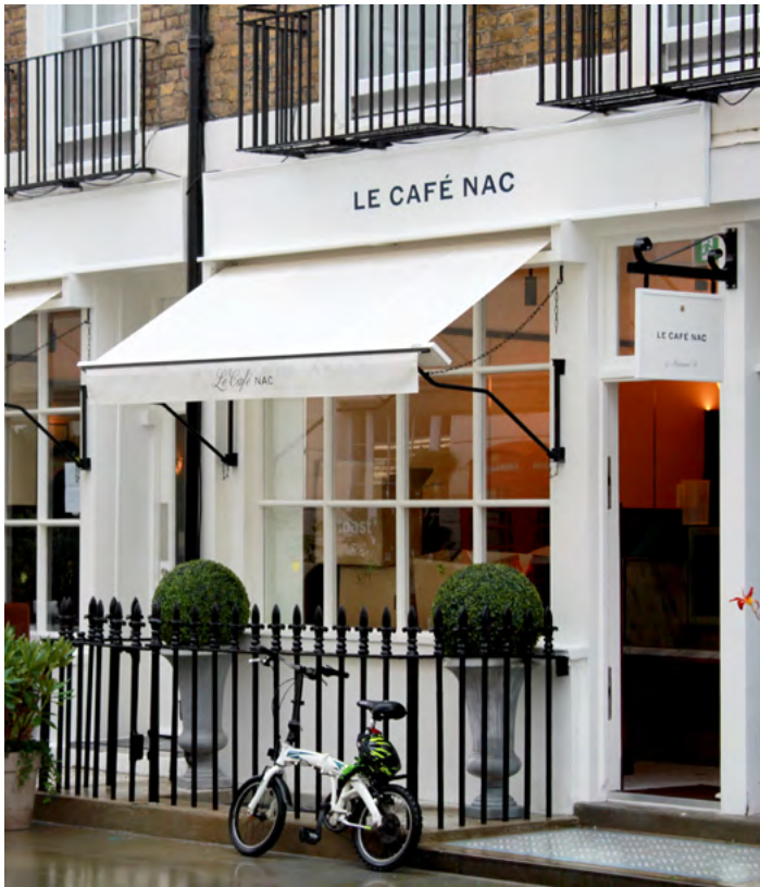
→ LE CAFÉ NAC 16-17 MOTCOMB STREET