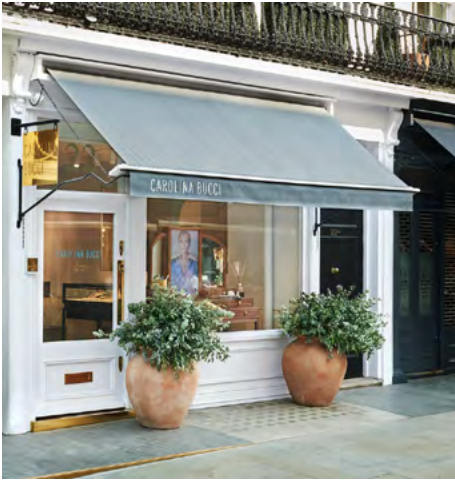
→ CAROLINA BUCCI 22 MOTCOMB STREET