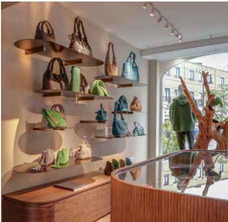
→ TISSA FONTANEDA 8 MOTCOMB STREET

Recent entrants to the street including Rene Caovilla, New & Lingwood and Sellier illustrate its developing focus on luxury fashion and leisure. Motcomb Street’s increasingly celebrated profile in these sectors is demonstrated by leading brands’ decisions to launch their first UK in-store pop-ups here in 2024, including Hailey Bieber’s Rhode Beauty, and industry favourite Veronica De Piante.