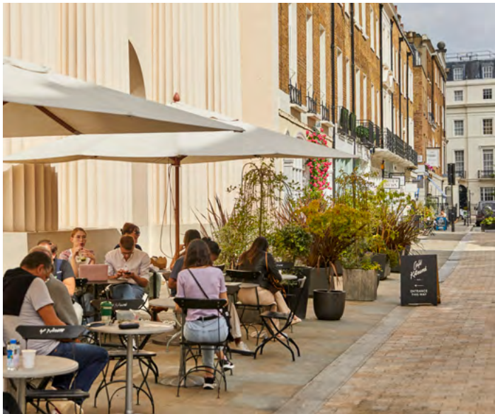
→ MOTCOMB STREET