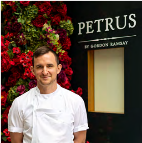
→ PETRUS 1 KINNERTON STREET