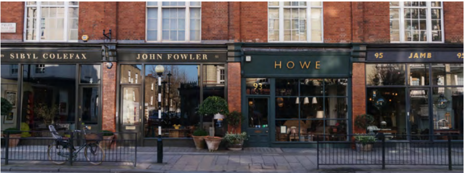
→ SIBYL COLEFAX & JOHN FOWLER 89-91 PIMLICO ROAD

→ “Pimlico Road and now with the beautiful new Newson’s Yard has now become the absolute pinnacle for luxury interiors whilst maintaining a friendly, approachable village feel synonymous with the street in the early days. There is such synergy and a strong collaborative feel amongst all the brands and tenants on the road and it is now the go to for inspiration, beautiful homewares, interior design and some fabulous restaurants attracting shoppers from all over the world.”