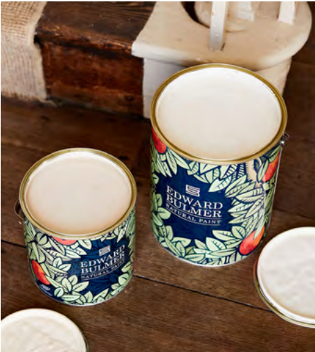
→ EDWARD BULMER 194 EBURY STREET