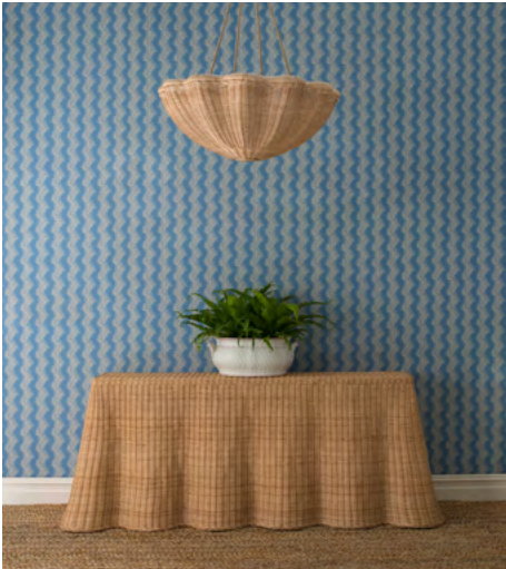
→ SOANE 50-52 PIMLICO ROAD