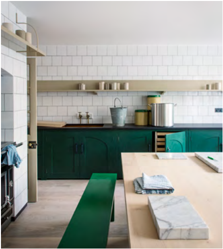
→ PLAIN ENGLISH NEWSONS YARD