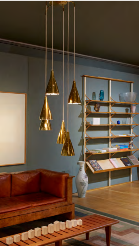
→ MODERNITY NEWSONS YARD