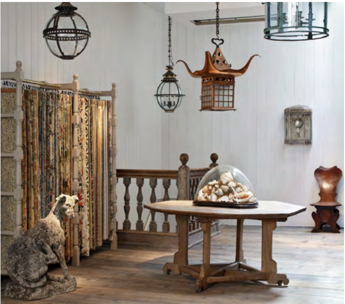
→ JAMB 95-97 PIMLICO ROAD