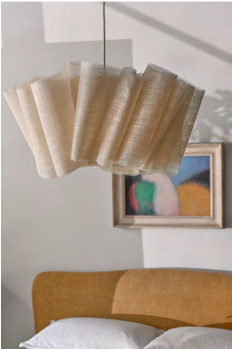
→ PINCH 200 EBURY STREET