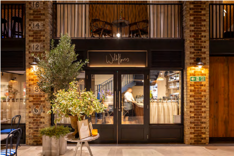
→ WILDFLOWERS NEWSONS YARD