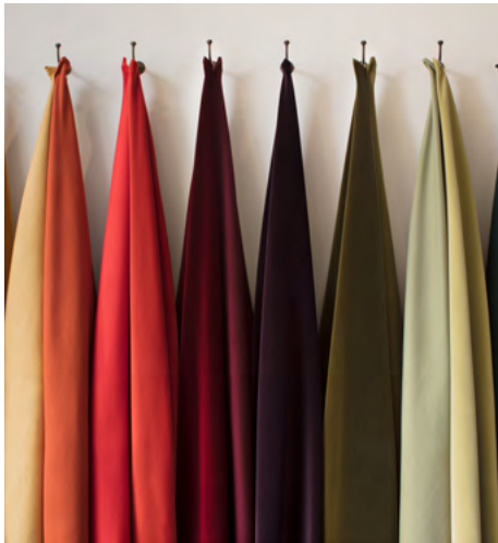
→ ROSE UNIACKE 76 PIMLICO ROAD