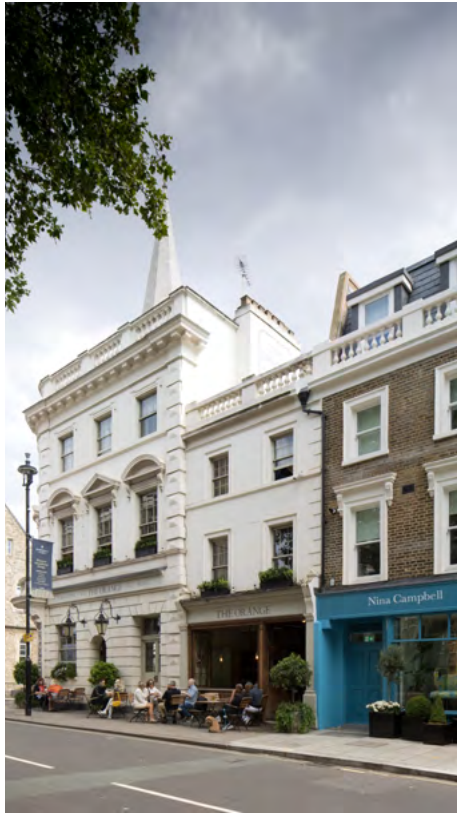
→ THE ORANGE 35-37 PIMLICO ROAD

Pimlico Road offers a vibrant dining scene that complements its design heritage. Wildflowers, a new restaurant by chef Aaron Potter, anchors the newly developed Newson’s Yard design hub in a historic timber yard. A variety of restaurants looking out onto Orange Square have earned reputations as Belgravia institutions, including La Poule au Pot, and Hunan. More recent entrants like Hagen Coffee, Daylesford Organics restaurant, and The Orange pub ensure the lively dynamism of the street from day to night.